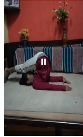
IIrd Prize – Cash prize of Rs 750/-